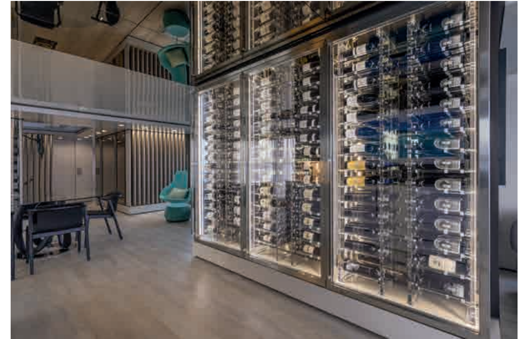
On the starboard side, a custom-designed wine cellar with a 150 bottle capacity acts as a divider between the guest areas and the master stateroom.